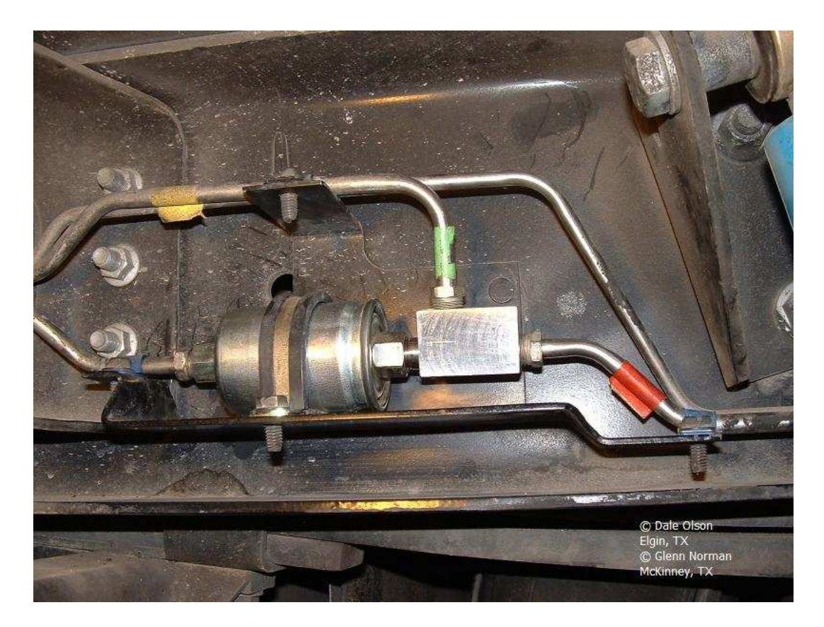
"P 32" Series Install Complete